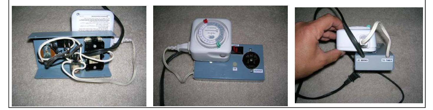
SPELEONICS 26 - July 2007 - Page 13 of 31

Set the lamp timer for the number of hours that the output (battery charger) should be on and then press the momentary switch to start the timing. I generally set the lamp timer to midnight so it is easier to count the number of hours to be used!